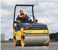
Tandem Vibratory Rollers (Greaves)