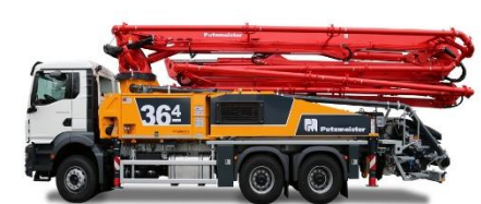
Truck-Mounted Concrete Pump