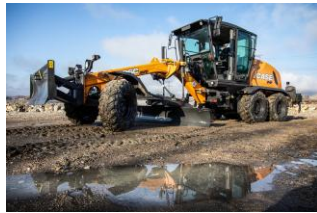
Motor Graders (Case and Volvo)