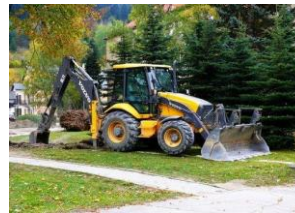
Loaders (JCB and Volvo)