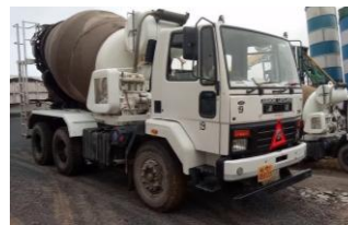
Transit Mixers (TATA)