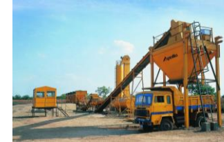
Wet Mix / CTAB Plant