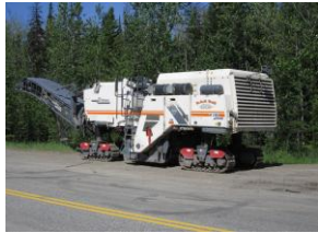
Milling Machines (Wirtgen)