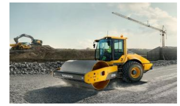
Soil Compactors (HAMM and Greaves)