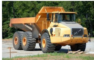
Dumpers / Tippers (TATA and others)