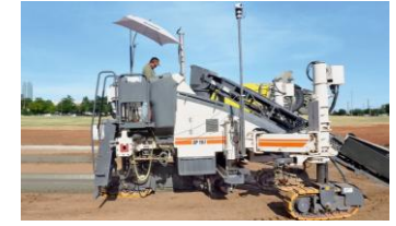
Concrete Pavers (Wirtgen)