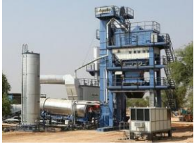
Bitumen Plants (Ammann and Apollo)