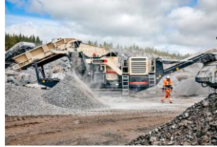
Crushing Plants (Metso – Voltas)